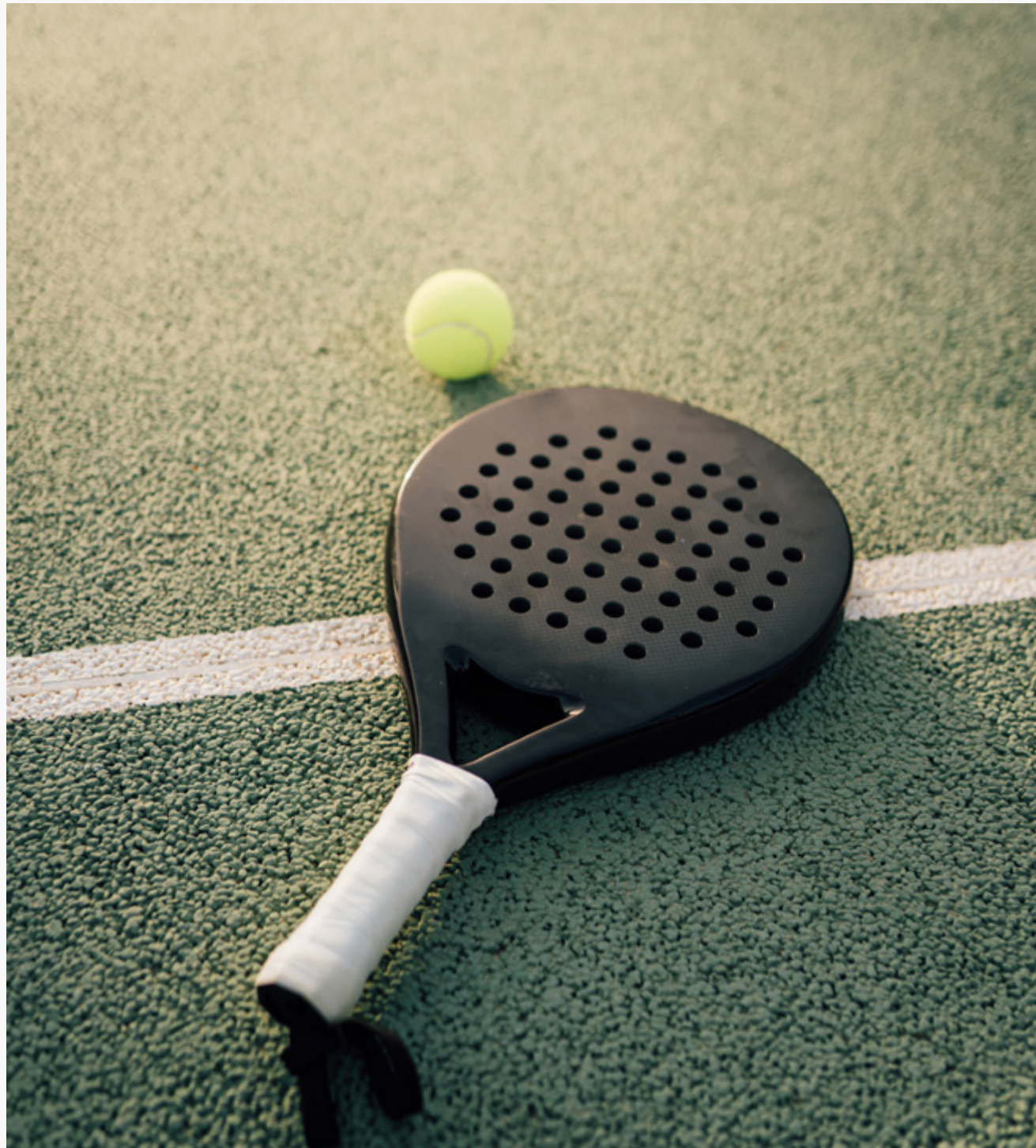
Padel Tennis Court